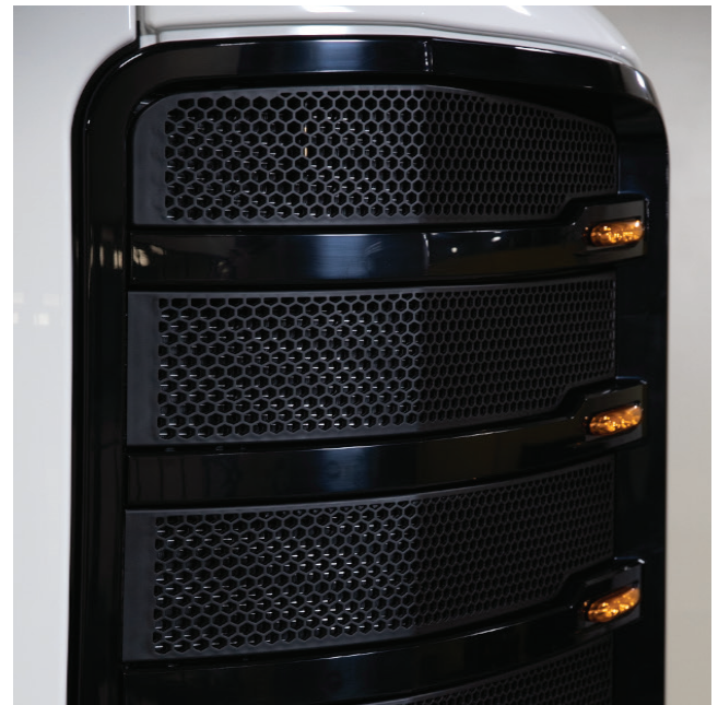
original grille style

For customers looking to further enhance their fleet's appearance, chrome and LED options are available.